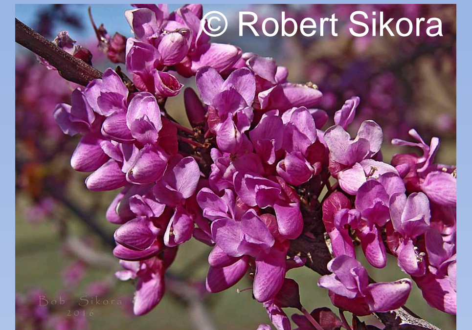
Redbud is covered with pink flowers each spring

The trees and shrubs featured here are native to California and thrive in our dry climate. Once established, they require very little water, provide excellent habitat for local wildlife, and do well in Vacaville's heavy clay soils. Planting native species in your yard can beautify your landscape and conserve water.