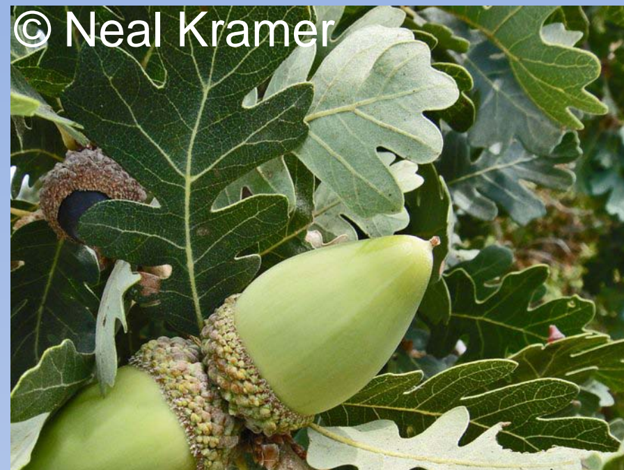
Valley oak trees provide shade and wildlife habitat

The trees and shrubs featured here are native to California and thrive in our dry climate. Once established, they require very little water, provide excellent habitat for local wildlife, and do well in Vacaville's heavy clay soils. Planting native species in your yard can beautify your landscape and conserve water.