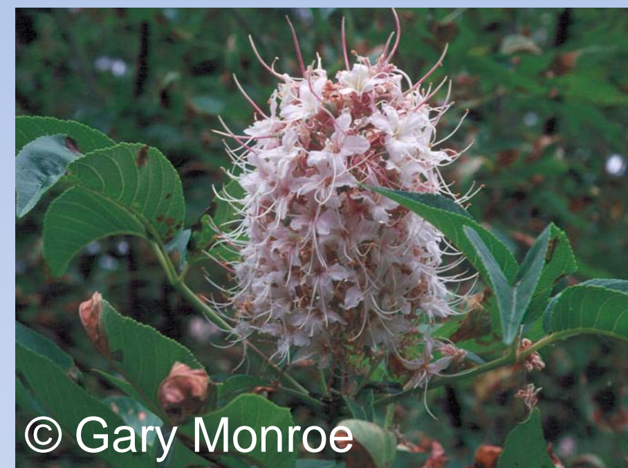
CA Buckeye blooms with pink flowers in early spring