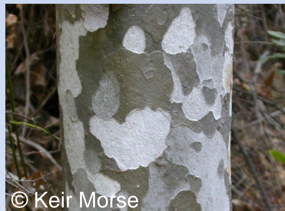
Sycamore trees have colorfully patterned bark

For more information on each species please visit http://solanorcd.org/demogarden