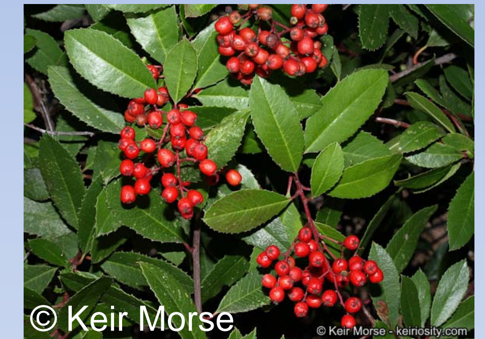
Toyon's red berries provide wildlife with winter food

Flannelbush Hollyleaf cherry Toyon Western redbud Wild lilac