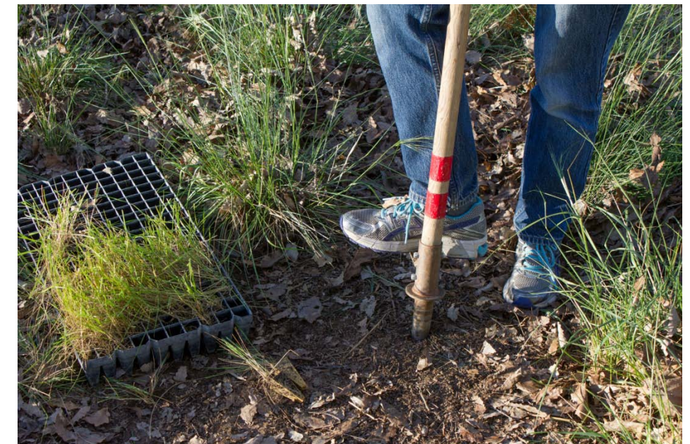
Plug tray and dibble stick, with purple needle grass ( Nassella pulchra ) in background.

Kill your existing lawn Before you plant your native meadow, it is important to completely kill your existing lawn. Shutting off all irrigation for an entire summer, using a broad spectrum herbicide like Roundup, and/or renting a sod remover are all feasible options for getting rid of a traditional turf lawn.